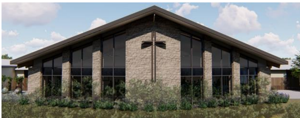
Artists Impression of our new Chapel & Wellbeing Centre currently under construction

The building of our new chapel and wellbeing centre is currently underway. We had outgrown our old chapel, there was very little room with our increased number of residents (from 40 – 60) and increasing number of high acuity immobile residents that come to chapel in bed chairs (also known as 'princess chairs'). The renovation will also offer a small private lounge area and kitchenette for residents and their families. Any financial support for our new chapel and wellbeing centre would be greatly appreciated.