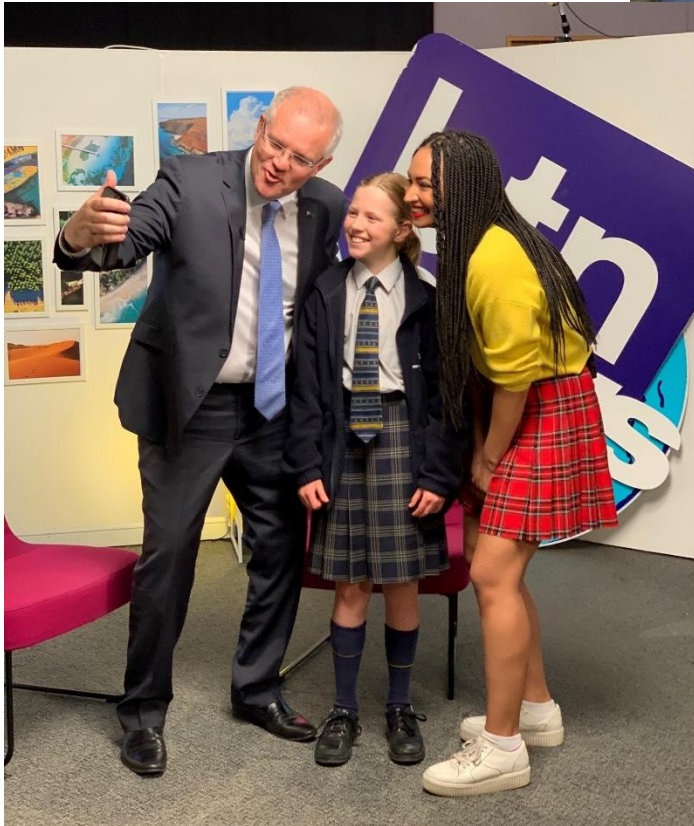
Students from Immanuel Primary School Novar Gardens interviewing Prime Minister Scott Morrison on television show 'BTN'.