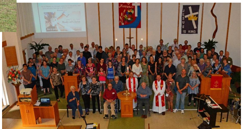
Members of the newly formed Berri Barmera Lutheran Church