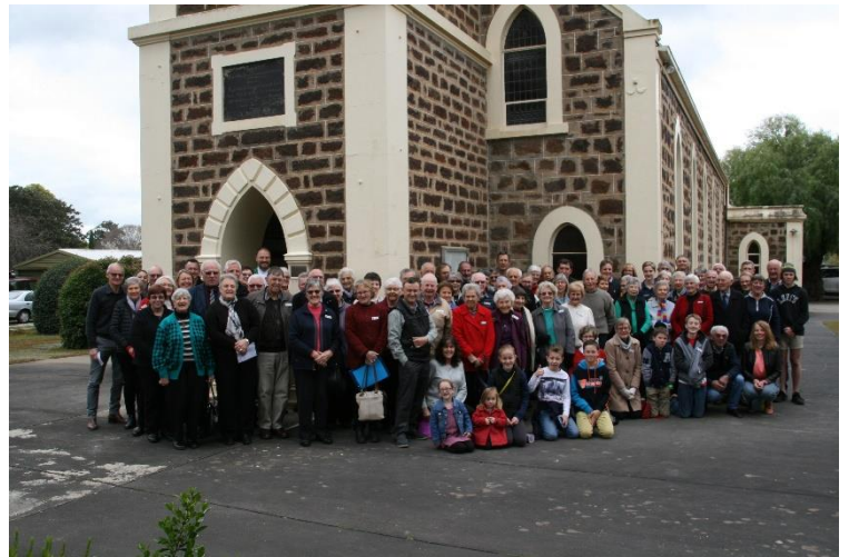
Members of Grace Lutheran Church at their inaugural service (merged entity of St Johns and St Pauls Tanunda congregations)