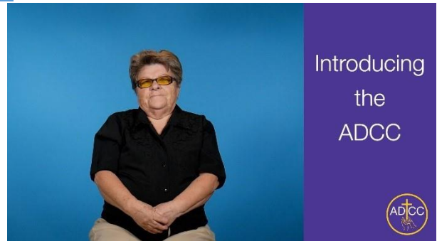
A screenshot from the ADCC video.

The video not only makes information about the ADCC more accessible to Auslan users, but it also showcases the new logo/branding which we have developed to provide a consistent and professional look across our future resources. Many thanks to LCA Communications for working with our congregation to develop this great logo.