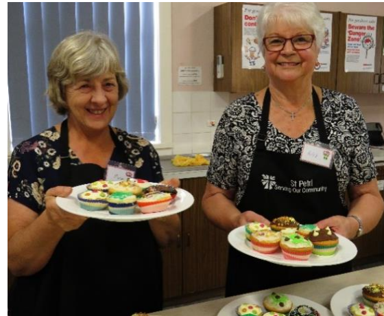
Scenes from Messy Church, above.

In 2016 St Petri Lutheran Church in Nuriootpa began Messy Church, with the mission of 'sharing the love and hope of Jesus' with their local community. Over the last four years the Lord has done more than they could ever ask or imagine, as Messy Church continues to share the gospel and flourish. In 2019, St Petri received the LLL Mission Stimulus Grant of $25,000 for Messy Church.