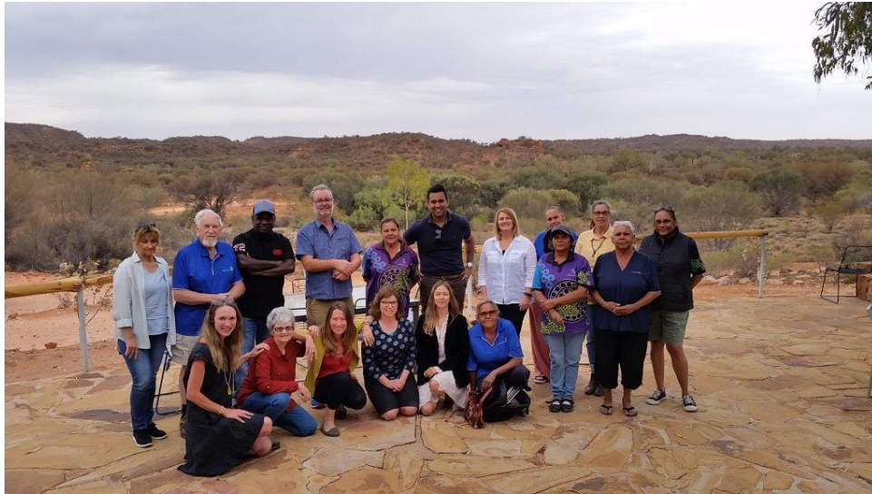
Central Australia Team with the Executive Team at the NT Staff Retreat Day 2019

I wish to specially acknowledge our incredible volunteers. Volunteering plays a critical role in empowering individuals, in fostering active citizenship and in building inclusive and resilient communities in which we can all flourish. Without this special group of people, the work we do would simply not be possible.