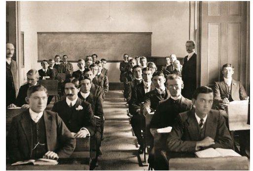
A 1906 Concordia College classroom

This year Concordia celebrates 130 years of 'Lutheran Education' in and through the Church. We praise God for this abundant blessing and draw inspiration and direction for the future from the College's original connection with the Church, its striving for academic rigour, its community focus and its desire to bear witness to the Gospel through this institution we now know as Concordia College.