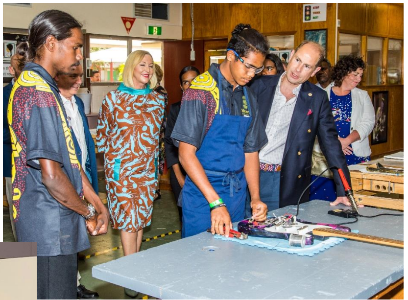
A royal visit for students at Yirara College