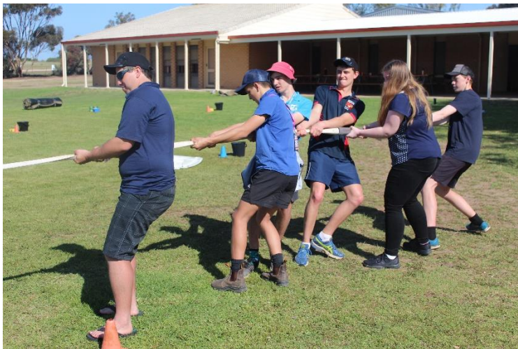
Campers having fun at Pt Hughes CLW 2019