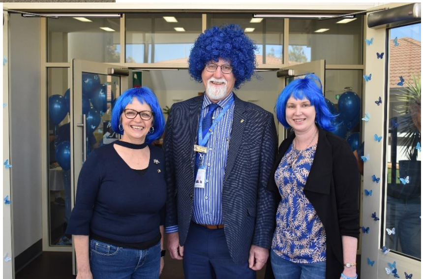
Having fun at Tanunda Lutheran Homes' "Get Loud Day"