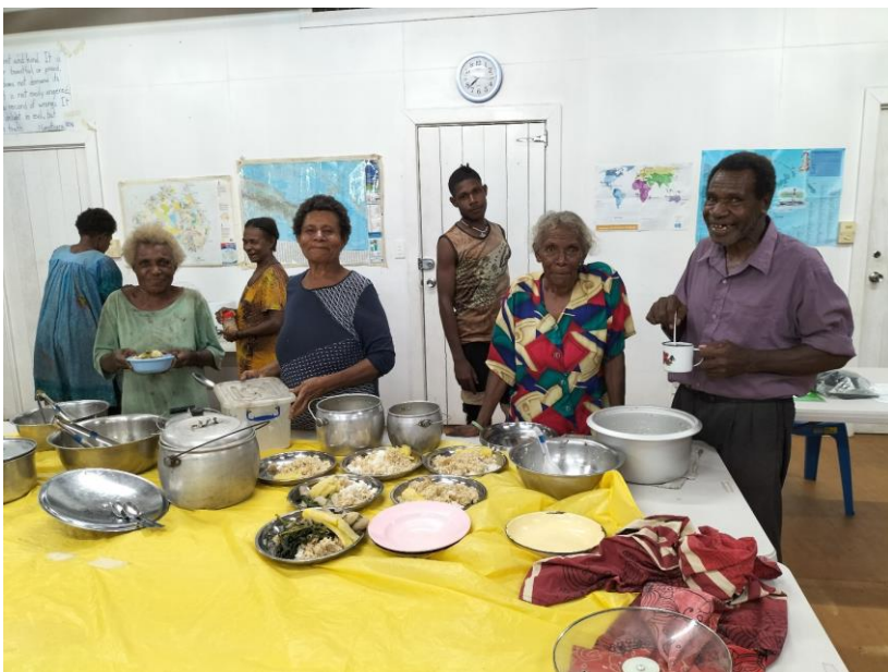
Sharing a farewell meal with the Kope translation team.