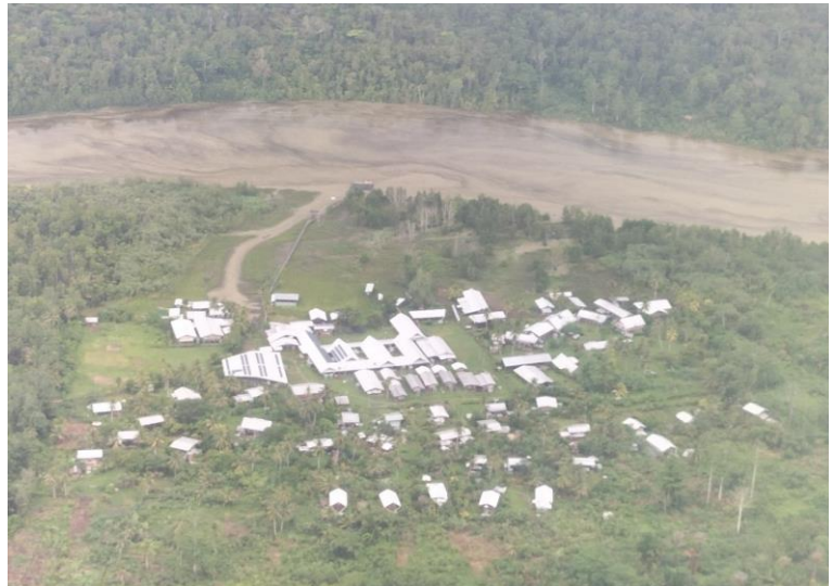
Kapuna hospital seen from the air.

*Iare are the people, I'ai is their language.