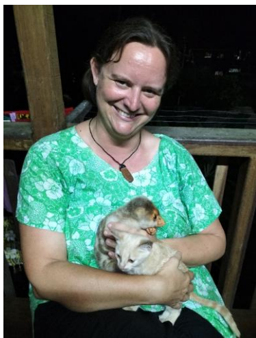
Spotted cuscus and kitten

Finally, we celebrated achievements in my work with the Kope . The typesetting of Luke is very close to complete (just some details in the front matter to fix), we are almost ready to submit the paperwork for an