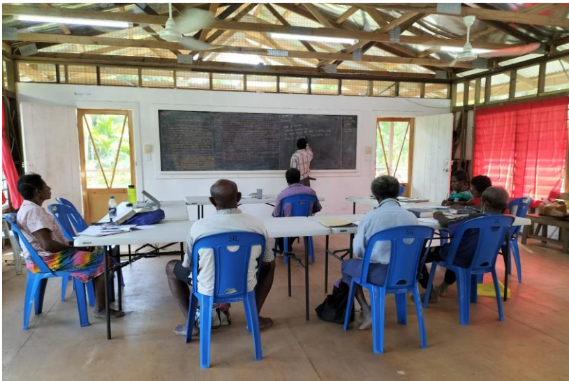
The Kope translation team working together.