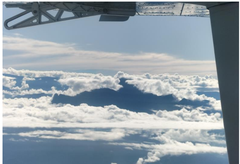
The beauty of flying in small planes in PNG!