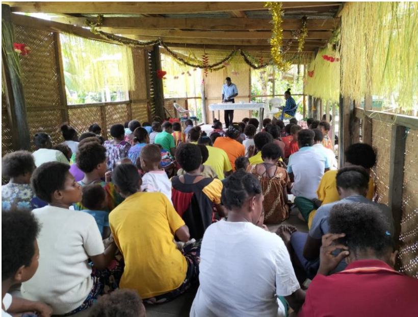
Worshipping together in Mira Goiravi one Sunday.