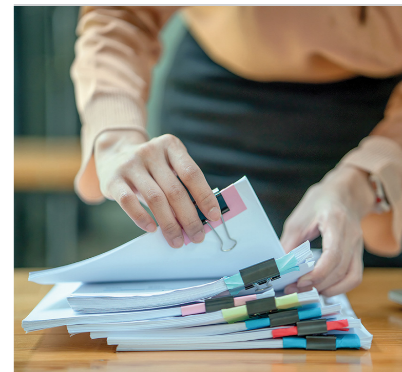
As Table 1 displays, a total of 109 documents were analysed