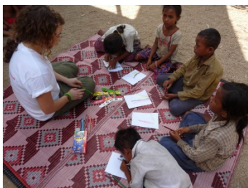
Unity College (SA) partnership with LWM Cambodia