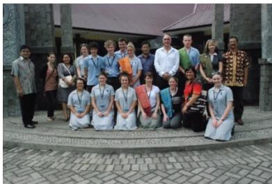
Students of Navigator College, Indonesian school partnership