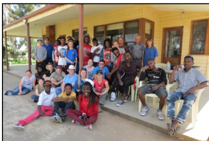
‘Schoolies Alternative’: Students of Tatachilla Lutheran College, SA and St Paul’s Lutheran church Shepparton, Vic

The LCA Mission through its Board for Local Mission (BLMiss) responds to the expressed needs of congregations and Districts of the LCA as they see the opportunities for sharing Jesus' love with the people and in the places where God directs. Some of these specific areas are in new growth corridors or in regions where people from a particular continent are placed or chose to live. The LCA is blessed by the many people from African and Asian nations who are coming to live in Australia.