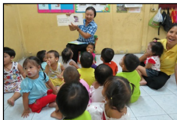
Home of Praise, Bangkok