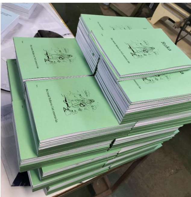
The pile of Kope Luke books at the Printshop