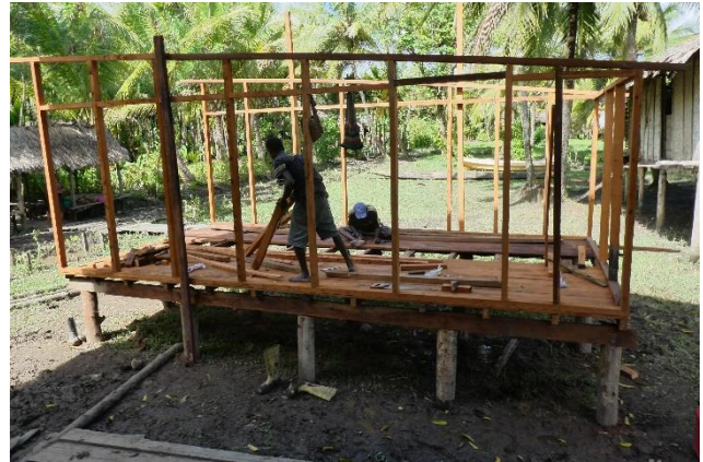
Building the OMTC kitchen in 2021. The toilets and wash-houses will be a similar village-style construction.

It is exciting that the OBS workshops are starting soon, and it is exciting that we will be using the Oro'io Madei (Living Word) Training Centre (OMTC) for this work, but we do not yet have a dorm where participants can sleep... instead we are reliant on the community to host people in their homes. While we will be doing all the catering, it is still a big request of subsistence farmers, that they open their homes to additional people for two weeks. This is why we need to build a dorm for the OMTC. Following is a description of the building stages we have coming up, each with a cumulative percentage of the budget we need to have raised by this stage of the project. Please consider supporting this work with your financial gift. You can give at Ubuo Training Centre & Dorm, PNG - Wycliffe Australia , where you can also keep track of the percentage raised, and relate it to the needs below.