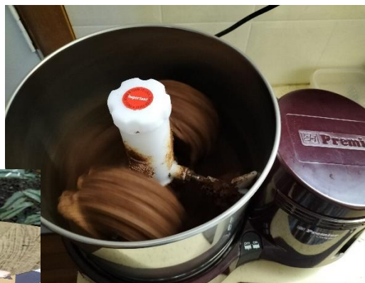
A new experiment... bean to bar chocolate made at home! I have lots of willing taste testers to help with this experiment ☺