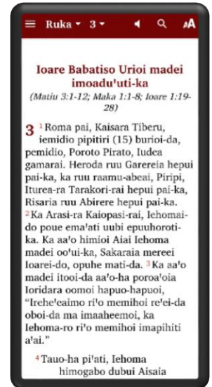
Kope Bible App