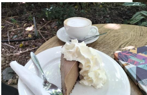
Holiday mode engaged! Enjoying coffee, cake and time to journal at a café in Cairns.