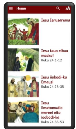
Trial version of Bible Picture Book app