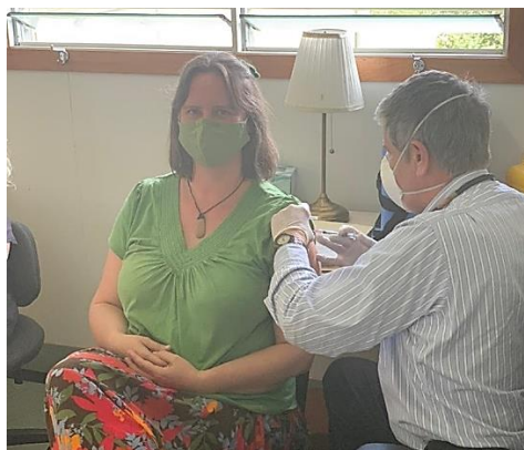
Receiving my first vaccination in June. My second one will happen later this week.

Pray for the new translation and linguistics workers who have arrived in PNG and discerning where they should serve. Gulf is one of many areas of need, and while I'd love to have new people join our team, knowing that they are where God wants them is more important than where I want them.