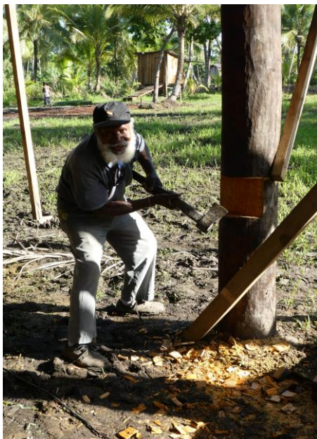
Notching the posts for the platform bearers.