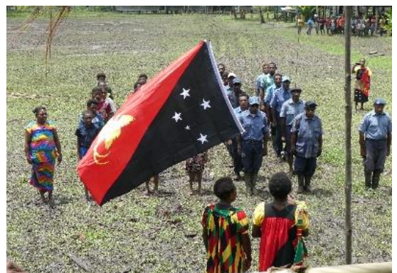
September 16, 1975, Papua New Guinea became an independent nation. We will celebrate 46 years of Independence while I am in Ubuo.