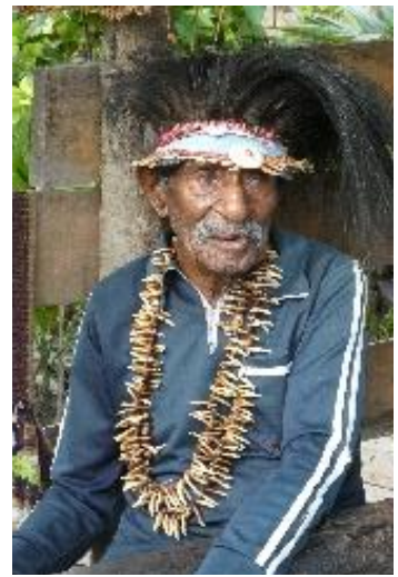
Proudly Kope, across the generations