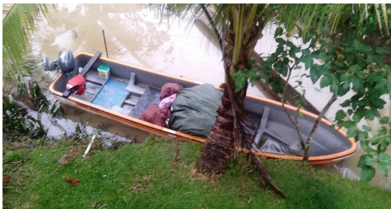
My boat loaded and ready to travel the three hours from Kapuna Hospital to Ubuo village. Pray for safe travel on this upcoming trip.

assumed and understood in my home place, after centuries of Christian teaching and influence, but how long will it take to see this change in these cultures? There were people in the checking team that day, who remember their grandmother telling them about eating human flesh (apparently it tastes sweet), and the change the gospel has brought since those times has been dramatic, but there is still a long way to go! For our home cultures too!!