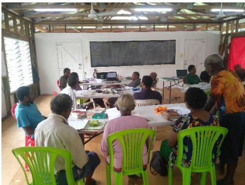
The Kope team working on drafting in February.