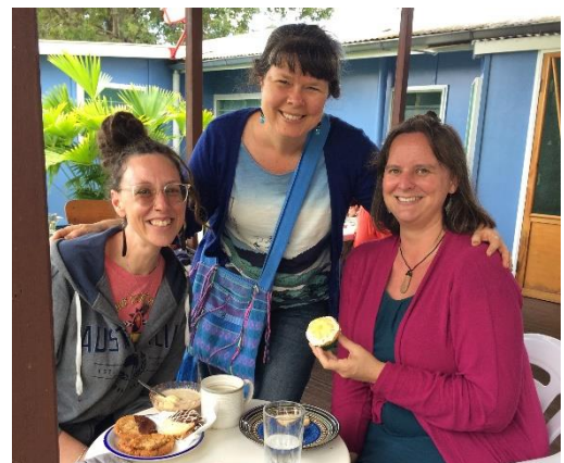
I've enjoyed the extra time in Ukarumpa, including time spent with good friends.