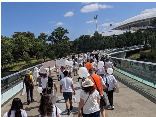
Photos from the Walk for Life (above and below)

Just this month, some of our Adelaide-based committee members and LfL supporters attended the annual Walk for Life organised by Love Adelaide . Thousands of people met in the centre of Adelaide on the grass outside of Adelaide Oval to listen to various presentations before walking up to and around government house. Being present at these walks is a wonderful way to stand beside other members of the body of Christ in promoting the value of human life.