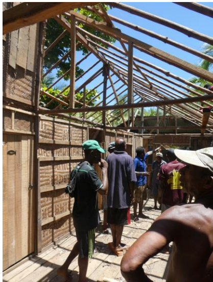
Village carpenters discussing the re-roofing of my house in January. A construction team from Ukarumpa will work alongside village workmen on the building of the training centre.

In October... at which point I pause and take a deep breath, as there are so many 'maybes' between here and there... in October, I hope that we will be able to build a translation and literacy training centre in Ubuo. This building will provide a dedicated space for the team to continue their translation and literacy work, as well as a classroom in which we can offer training in translation, literacy and Scripture Use to other nearby language communities. I have sent the plans to the Kope, and they are excited. They have already put aside the land for the building, and are organising the 36 kwila posts that will be the foundation. My job is to raise the rest of the funds... and it is a lot of funds!