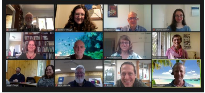
Ah, zoom. Covid would not be the same without it! This screenshot is of all the people who attended the online anthropology course.

I have also had the opportunity to be part of some training courses, either in person or online. Having the time for such professional development is a real blessing. The work I do is complex, and there is always more to learn. My most recent course was an anthropology intensive, that has me thinking about how we can best communicate the truth of God's love within the PNG worldview, when I have learnt it with an Australian worldview, and the Bible was written over centuries of changing Jewish worldview. I am thankful that the Spirit helps us to communicate over all these boundaries, as on our own we would surely get it wrong.