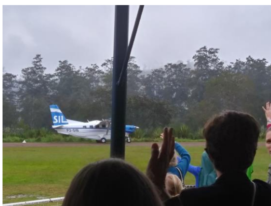
Farewell to friends! The price of love is grief, but it's worth it.

Stereotype: single woman turns 40, stops leaving the house, starts collecting cats.