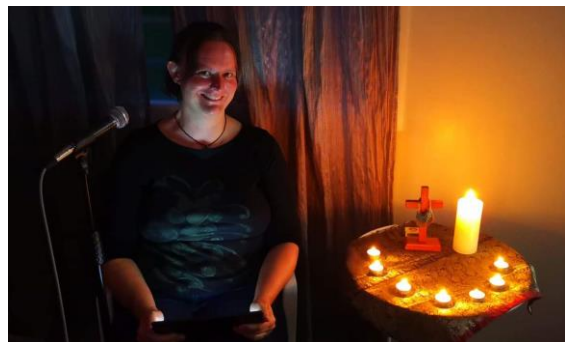
Leading the Good Friday Tenebrae service over our intranet-streamed radio station. People at home also had their candles and worship spaces, and it was an unusual but beautiful time of being together-but-apart.