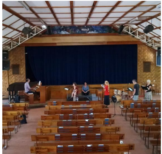
For some time, large indoor gatherings were banned, so church went online. This is us pre-recording the music for Good Friday in the empty Meeting House, where church is usually held.