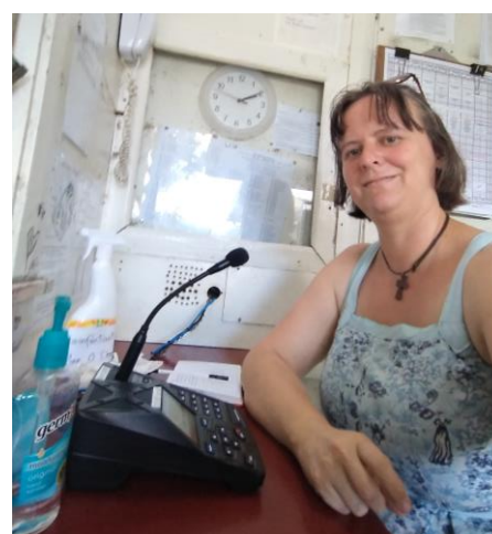
"Juliette 7-2-8, this is Alpha 3-3-8. Do you read me? Over." At the radio for my weekly sked with the Kope translation team.