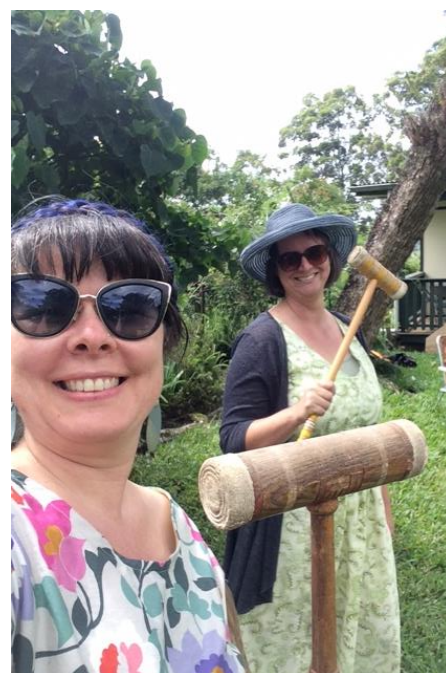
Socialising while maintaining covid distancing protocols has meant outdoors events such as picnics and croquet.