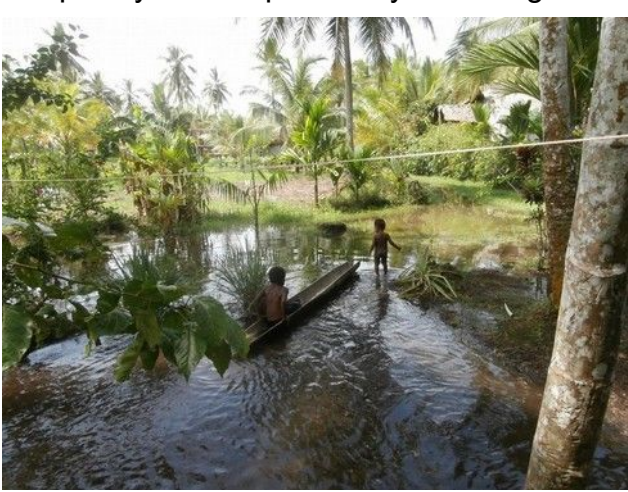
My neighbour's kids enjoying splashing about in my front yard when a spring tide caused flooding.