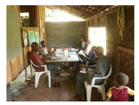
The Kope translation team at work