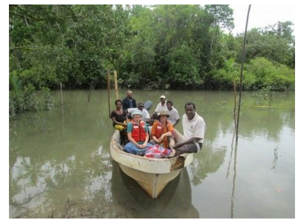
The boat I've previously travelled in with the translation team.

My travel around the area of Gulf where I work is all on the water, so having my own boat makes this a little more simple. Thank you to Redeemer congregation in Toowoomba for raising the bulk of the funds I needed to buy a 23 foot dinghy and a 40hp Yamaha outboard motor. I am looking forward to using them. Please pray for me as I navigate the complex river system of the Gulf delta, for wisdom in when to share my boat with others, and for no mechanical or technical problems.