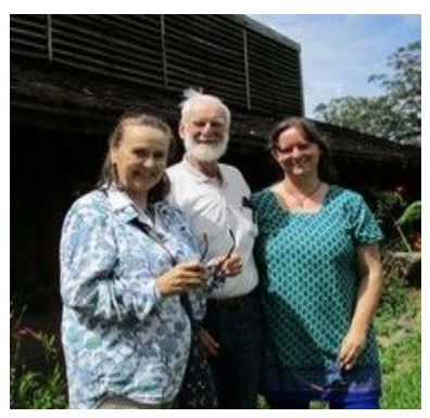
My parents came to visit!!!!