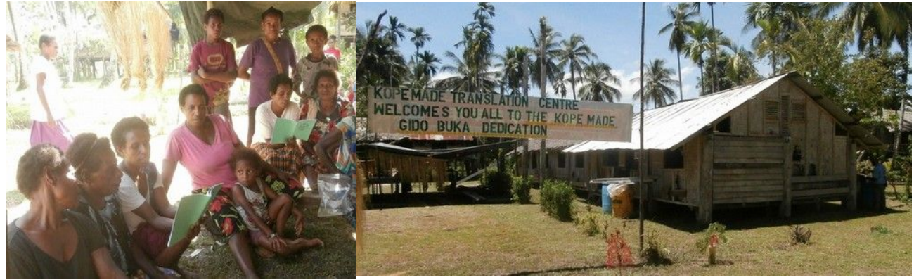
Singing together from the new song book

Actually, there is a little more exciting news; in March we dedicated the Kope Language Song Book that we have been working on over the last few years. It was a fun day of celebration and song. Sorry for the shortage of pictures of the actual dedication, I was enjoying myself too much to remember to get the camera out!