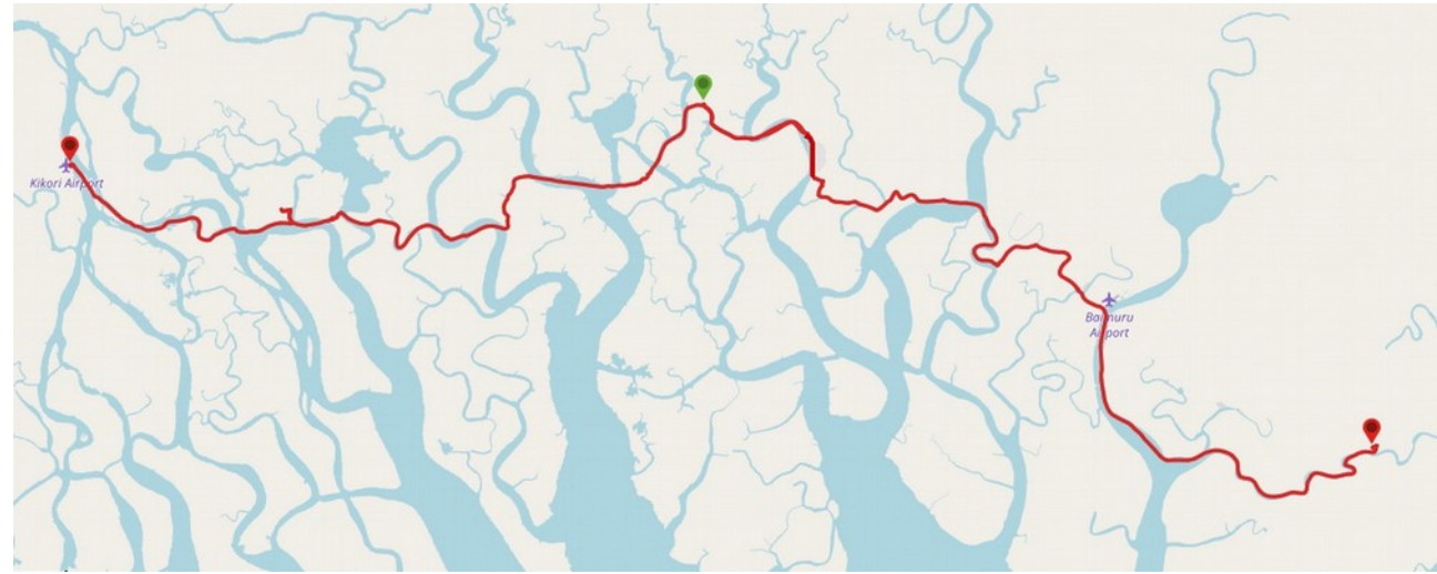
The challenging web of rivers that I navigate. The red mark on the left is Kikori, the green dot in the middle is Ubuo, where my house is, and the red dot on the right is Kapuna hospital, where I will store my boat.