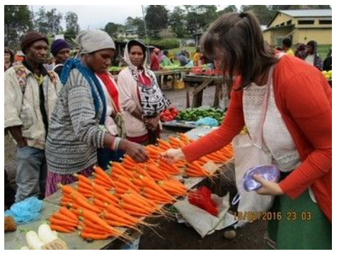
Things I like about living in the Highlands while working on my MA: lots of yummy fresh veggies from the market