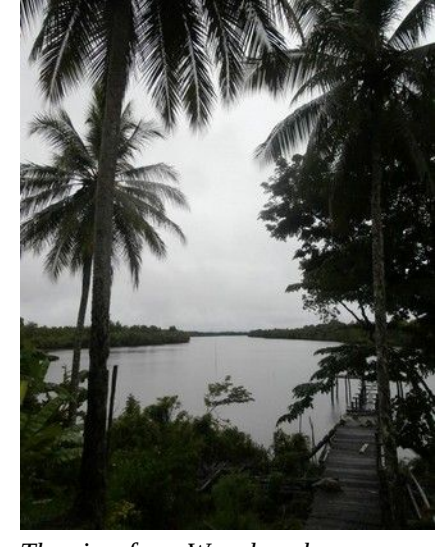
The view from Wouobo when we spent a few days working there.