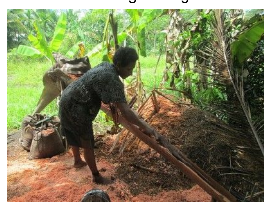
Making sago, the staple food.

During the rest of my village time, I will continue training the Kope translation team and checking any drafts of Luke they have done in my absence. Pray for good relationships, good insight into the draft, good health and safe travel during this time. This will be my last village trip for about a year, as I will be going on furlough, so please be praying that I am able to provide any materials or training that they require for their year of working independently.