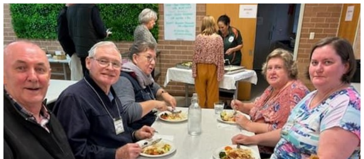
Participants at the District Prayer Gathering