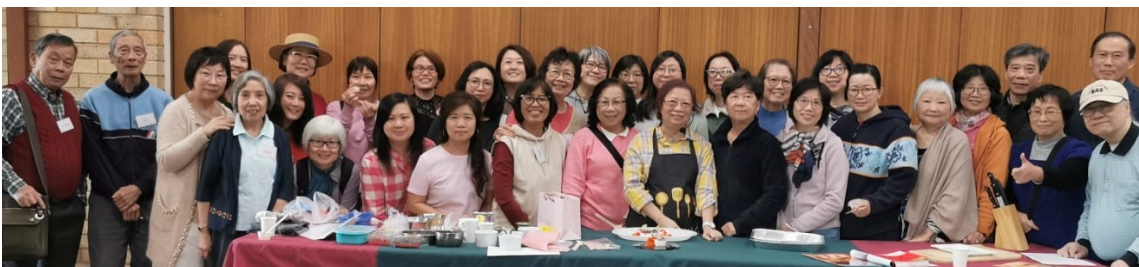
Many visitors enjoyed the cookie baking demonstration