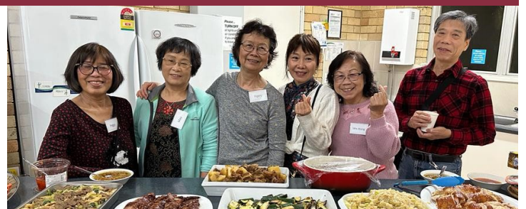
LifeWay Chinese celebrate Moon Festival