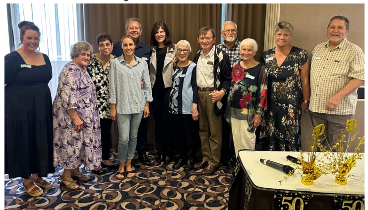
Past and present friends of St Marys Kindergarten joined in the 50th anniversary celebrations