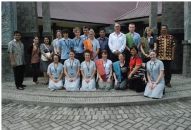
Students of Navigator College, Indonesian school partnership

There are a range of opportunities for schools to partner with and serve in Indonesian Lutheran churches and schools.