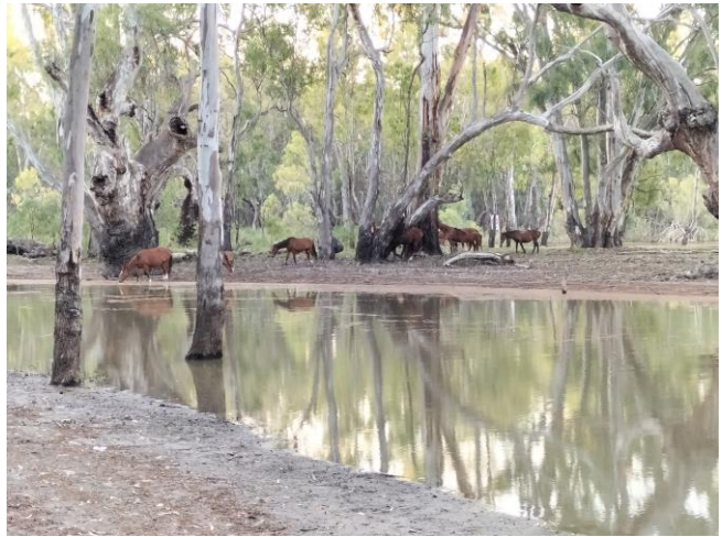
Brumbies preparing to cross the river at Barmah on the Murray