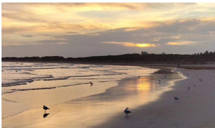
Besides for time with family and friends, the best part of being back in Australia, was the beach!

Etc... There are many things to pray for through this newsletter, so thank you for bringing them all to God in prayer.