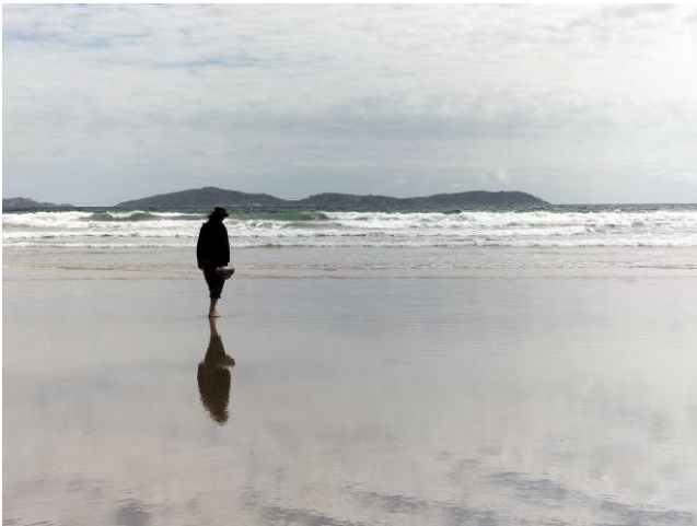
Walking at low tide at Wilson's Prom