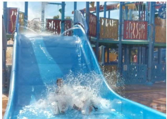
A day at a waterpark with Clare's kids