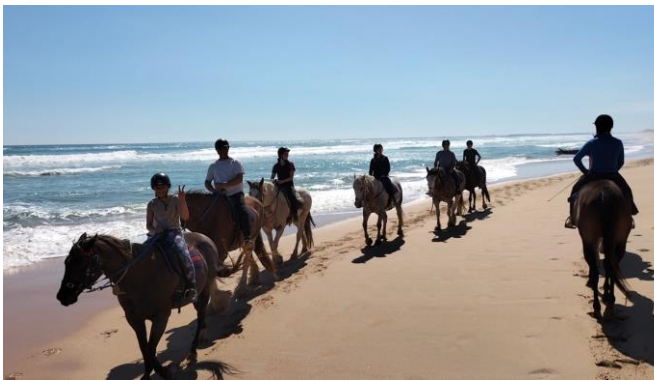
A beach horse ride with my niece