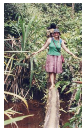
Log balancing is still part of my PNG life!

God is doing many exciting things in the delta area of Gulf Province , and I am privileged to be part of it. Thank you for your part in the work, as you give, pray and encourage.