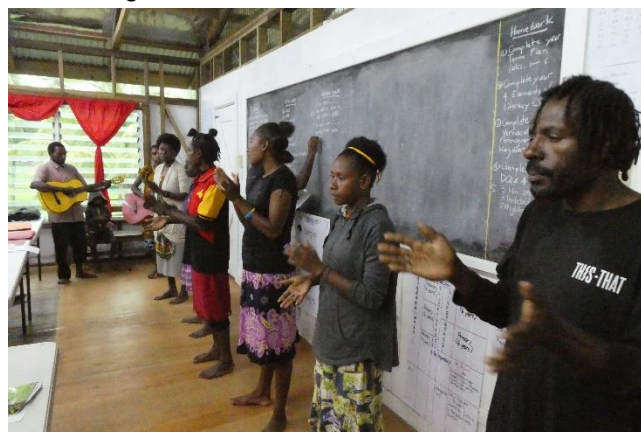
A time of worship and Bible study to start the day are a feature of all our workshops.