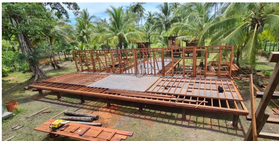
The first wall of the dorm is in place.

Praise God for all that has happened in the Onobasulu translation project and pray for the translation team as they work to complete the New Testament in Onobasulu.