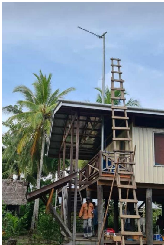
The new antenna on the roof of the OMTC, pointing at the Aird Hills phone tower.

After OBS is complete, there are a few days until the Vernacular Path to English (VPE) training course for literacy teachers commences. This is a three-week course (Mar 8-31) taught by four staff from the SIL Literacy Department. We did the first part of this training, Vernacular Creative Phonics (VCP), in Sept-Oct 2021, and have invited the VCP participants back to continue their training with VPE. As with OBS, pray for logistics, staff, participants, their families and their communities.