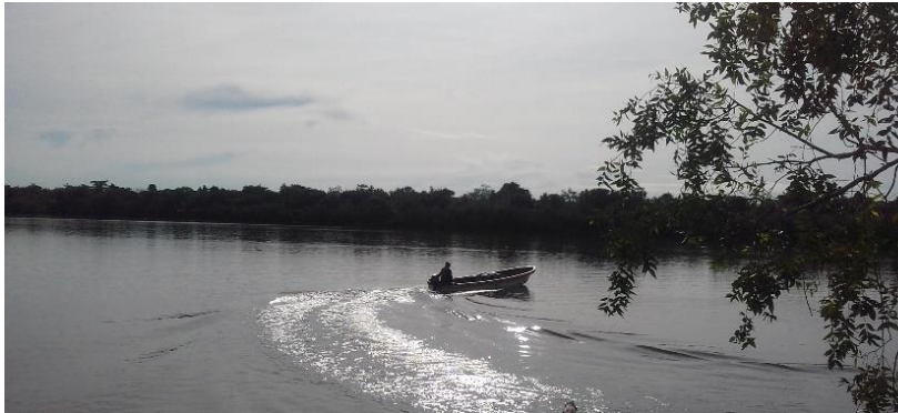
Driving my boat... pray for safe travel!

I intend to be in Gulf Province Jan 25 to Apr 5. This is a ten week trip that is packed with a building project and two workshops. Pray for me to have the grace, strength and wisdom I need for each day; this is a long trip with lots of people coming and going for workshops. Pray for good health, for myself and for everyone I am working with. I continue to struggle with chronic headaches, so pray that they would cause minimal disruption. Pray for good relationships with those around me, particularly with the challenges of cross-cultural relationships. Pray for safe travel for me as well as for all the builders, workshop leaders and workshop participants. Continue to pray for the ongoing challenge of speaking Kope.