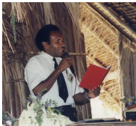
Dedication of Mark in Onobasulu, Jan 2003.