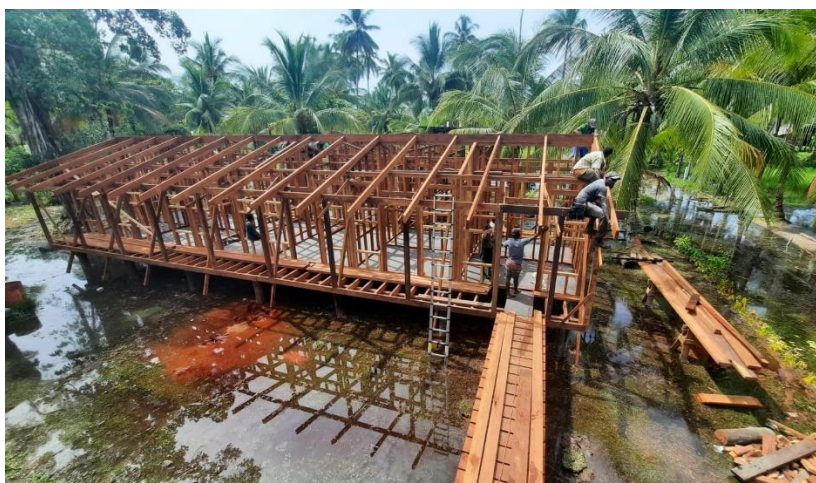
The dorm after one week of building. Our land is a tidal flood zone, and a spring tide flowed through the property on the weekend.