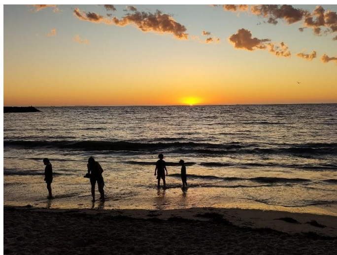
One of the joys of summer in Perth was many trips to the beach.