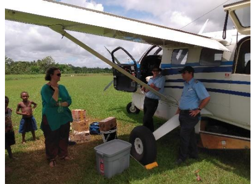
I am thankful for the Aviation department and their critical role in getting me to and from Gulf.