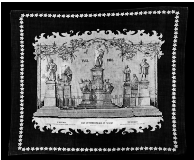
A 400th anniversary souvenir cloth showing the Luther monument in Worms

By contrast again, the same event was celebrated in St Louis, Missouri USA, with a popular festival at the fairground where a crowd of 8000 heard two addresses (not sermons) on the significance of the day, following a two-hour long procession of 576 vehicles and 1500 pedestrians through streets decorated with American flags, garlands of flowers and banners with Bible verses. Each congregation with its banners was preceded by its band, the children were transported in 76 open carts, and the highlight was a cavalcade of 300 coaches each bearing four young women dressed in white with blue ribbons and sashes, and myrtle blossoms in their hair. "A more charming sight has never been seen in the history of St Louis" ( Australische Zeitung Adelaide 21.9.1880 p10).